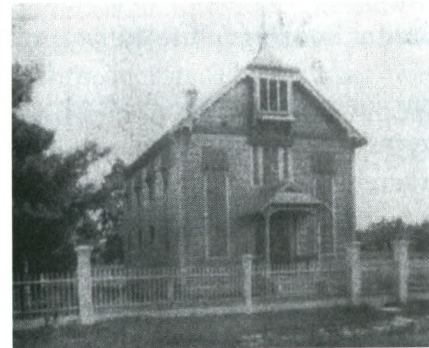
The Methodist Church on Sound Avenue