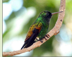
"Copper-rumped Hummingbird"

Sooner or later, we all dip our beaks into the world of bird watching. Some have a mentor to guide them. Others wonder "what bird is that?" and consult their library's copy of Sibley's or Peterson's Field Guides. Either way, the thrill of avian life is certain to capture your imagination and jumpstart your birding chapter.